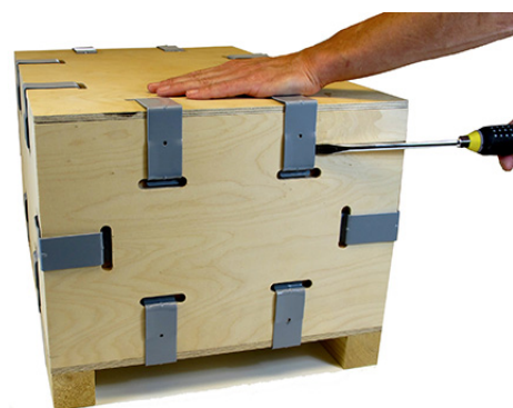
Easy to disassemble and reuse.