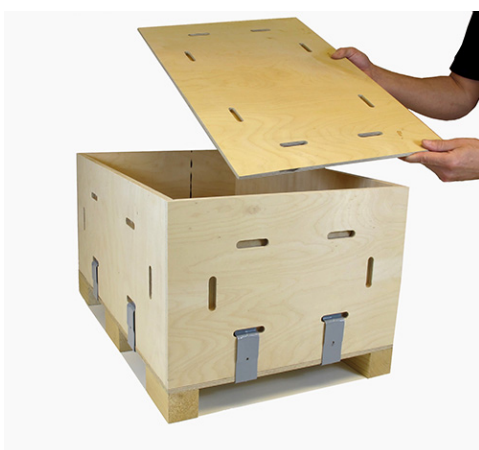
Easy assembly with clips.