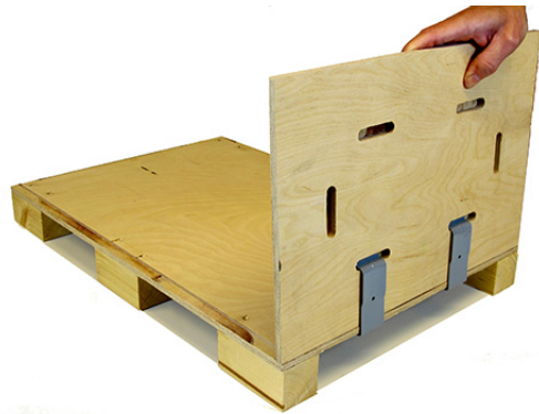
Ergonomic assembly one side at a time.